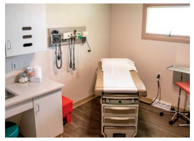
Renovated exam room