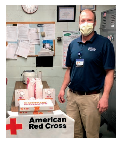
The American Red Cross donated coffee and donuts for various departments during COVID.