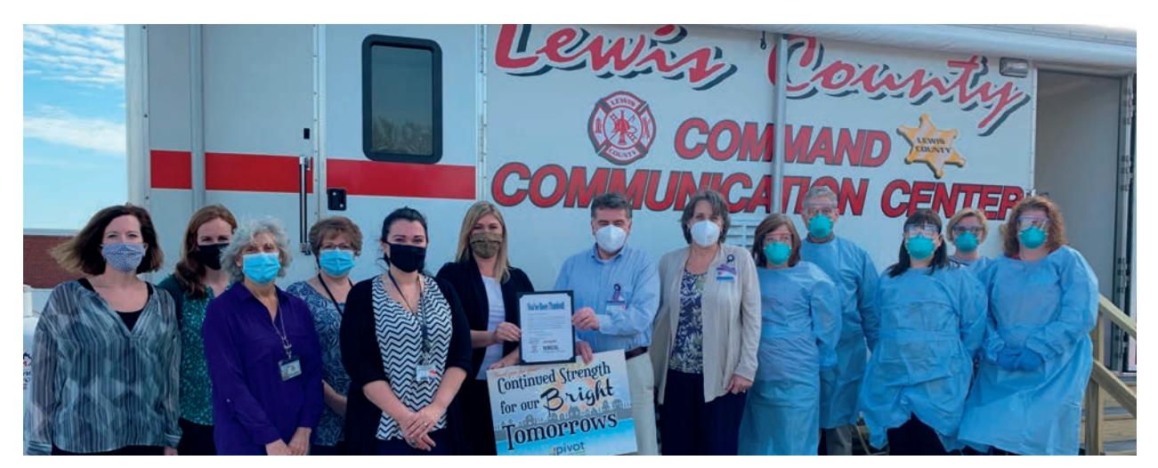
LCPH staff present LCHS team members with a PIVOT Award to recognize the facility for their continued strength and dedication during the 2020 COVID-19 pandemic.

I am confident that with the continued support of our health care team and the community, Lewis County Health System will remain strong and continue to positively impact the health and wellness of the people we serve in Lewis County and throughout the North Country region.