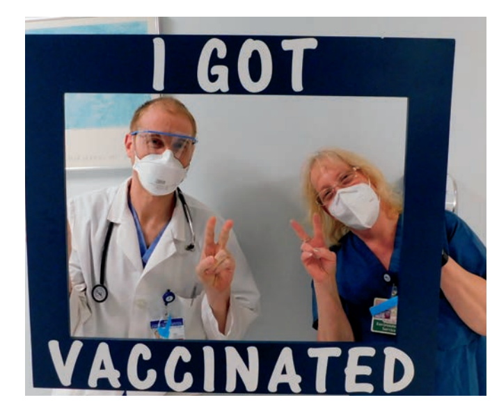
Staff get vaccinated to protect their patients, residents and each other!