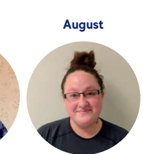
Stephanie Kirkbride Nursing Home