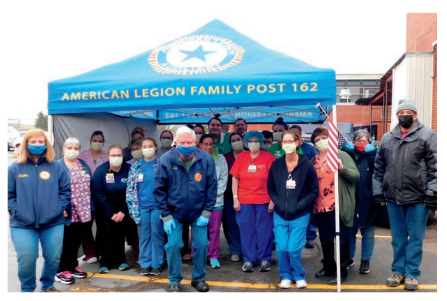
Lowville American Legion volunteers set-up on campus outside the cafeteria to provide a barbecue lunch for staff.

Local faith-based organizations donated assorted snacks, iPad's and accessories. The iPads were important in keeping residents connected with family and friends during COVID-19 when the Residential Health Care Facility was closed to visitors as part of the safety regulations put in place by NYSDOH.