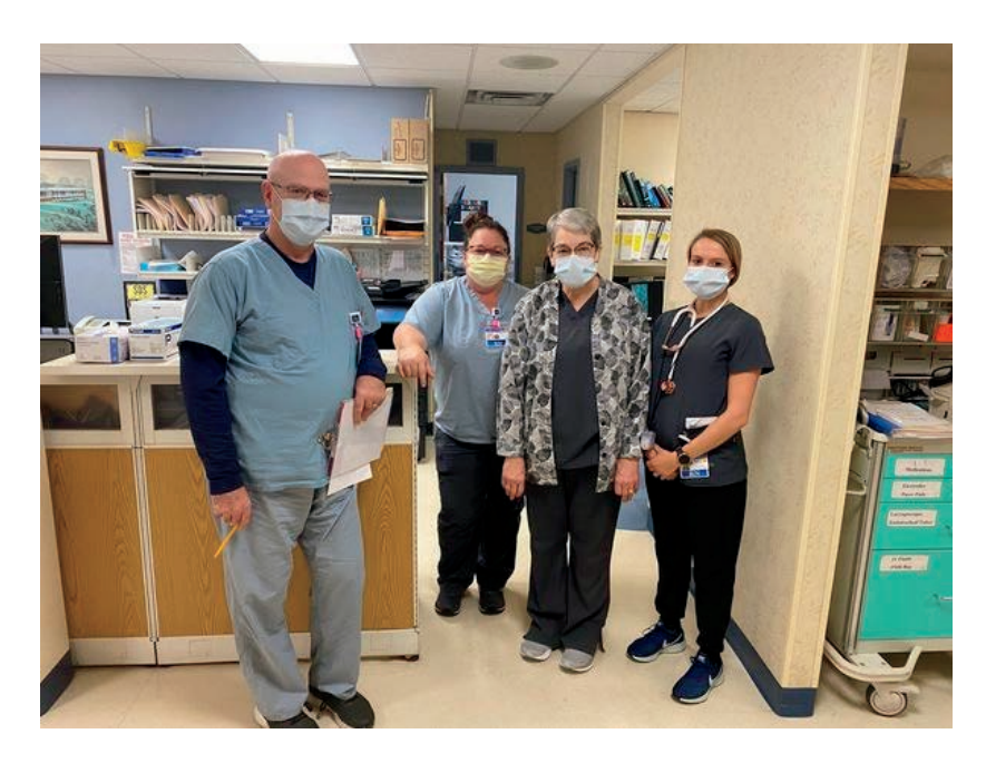
East Wing Nursing Staff