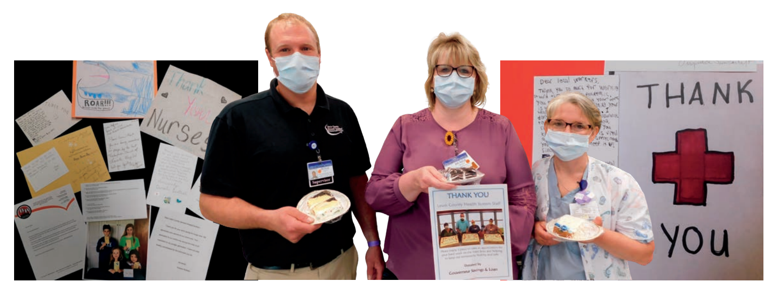
Community members and local church groups sent thank you and encouragement notes and cards for staff during COVID. The local Gouverneur Savings Bank provided cakes to bring smiles during the pandemic.

The next wave of support came in the form of snacks delivered to the health system for our frontline health care workers. These gifts were from individuals, faith-based organizations, local businesses, and schools. Snacks, cake, cookies, flavored water, iPads with accessories, and hundreds of inspirational cards and notes were delivered throughout the pandemic. The generosity was inspiring, and they brought smiles to staff and residents during a tough time.