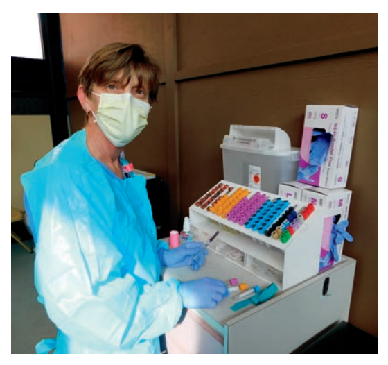
Lab staff provided blood draws at the draw room so patients didn't need to come into the hospital for routine lab testing.

LCHS postponed non-emergency surgeries and elective procedures, restricted visitors, implemented screening and social distancing protocols, and altered the flow of how patients and staff enter our facilities. We converted space and added beds in preparation for a sudden influx of patients and created additional negative pressure rooms to prevent cross-contamination.