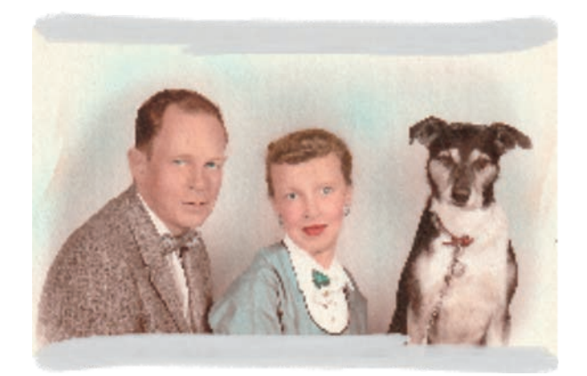
The McSweeney Foundation donated $25,000 to the Lewis County Hospital Foundation to support the purchase of the Rapid Testing Machine.

AVANGRID, Inc. donated $20,000 to the Lewis County Hospital Foundation to support the purchase of the Rapid Testing Machine.