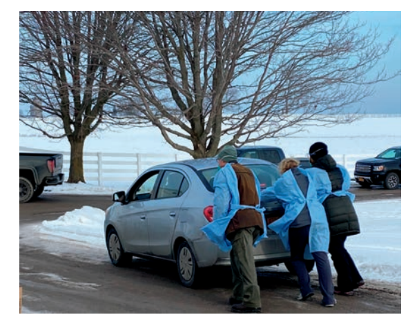
Staff assist a driver in need during the winter months at the Maple Ridge COVID testing site.

The drive-up collection site for COVID-19 testing initially was located at the hospital, then later moved to Maple Ridge Center. Staff organized swiftly to establish and implement testing protocols, staff training, and a positive patient experience. Staff worked collaboratively to ensure that testing samples were collected and sent to a NYS designated laboratory, provided education to patients on how to obtain their testing results, and offered education on what to do if they tested positive.