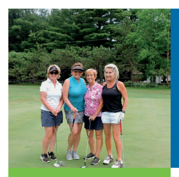
Forty teams participated in the 2021 Lewis County Hospital Foundation Golf Tournament at Brantingham Golf Course.