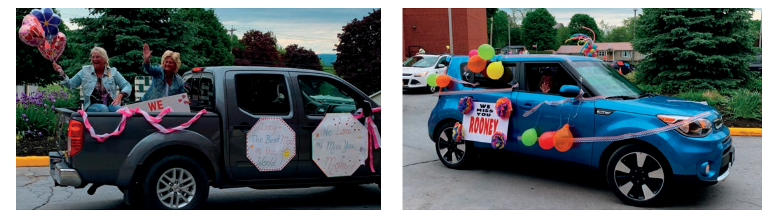
Resident families participate in a drive by parade to bring cheer to residents, many had not seen their families for months due to New York State Department of Health COVID-19 visitation restrictions .

RHCF could not have navigated through the last two years of the pandemic without the unwavering support of our staff, resident family members and friends, and our community. Together we are stronger. Together we will move forward.