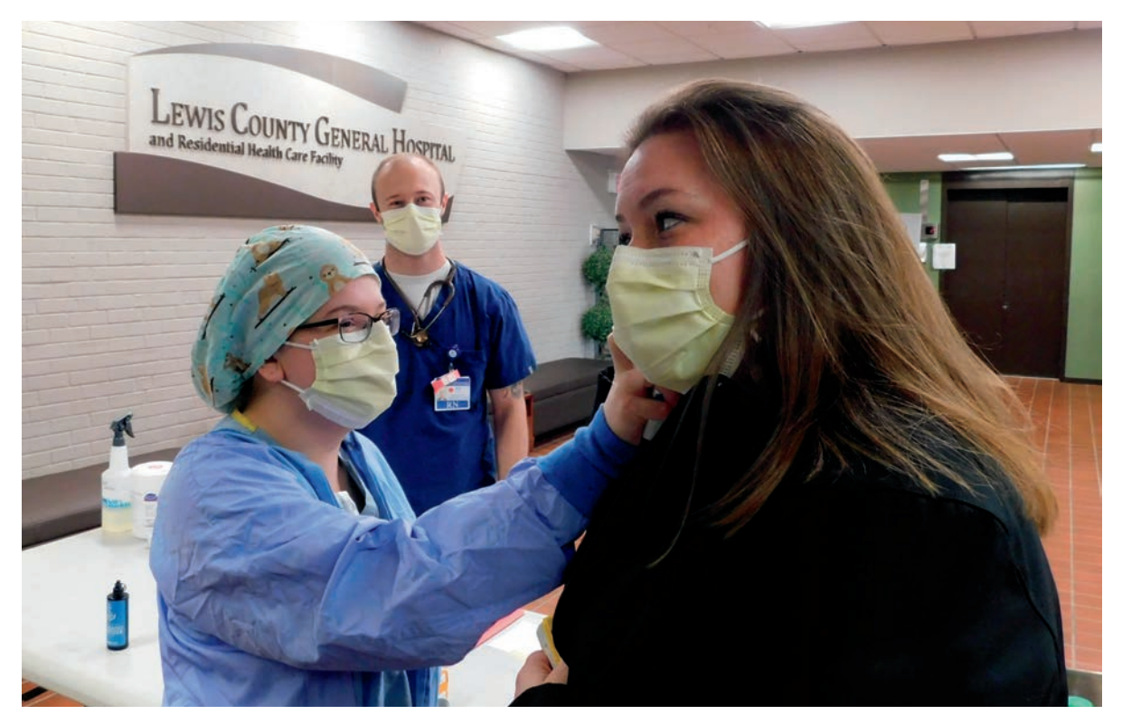
Screeners screen patients and staff for COVID symptoms to help ensure a safe environment for everyone.

Working with our clinical, administrative, support, and front-line teams, we navigated through uncharted waters to adopt best practices. This collaborative approach led to an organized preparedness effort for our community that remains in place today, making it safe for people to resume their health care in any of our facilities.