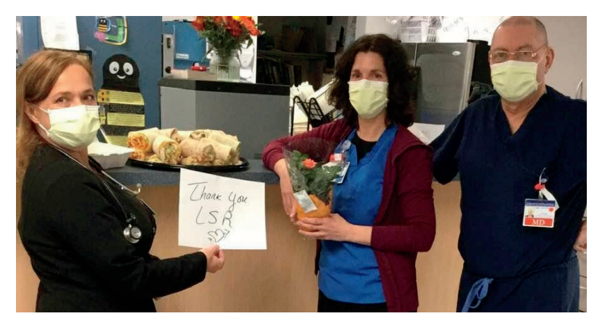
The Emergency Department team says thank you to Lewis County Search & Rescue for lunch donated during COVID.

*Does not include Post-Retirement Benefit Obligation (GASB75) (GASB68) 2019, 2020, 2021 financials audited by Fust Charles Chambers LLP.